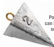
Pointed base can bury itself in soft terrain

The Pyramid Sinker excels in strong currents with any bottom condition. The pyramid tends to bury itself if the bottom is soft. On hard bottoms, the flat sides will prevent the pyramid from rolling with the current.