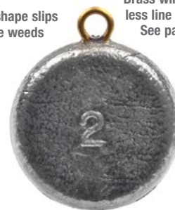
Brass wire eye for less line abrasion See page 70