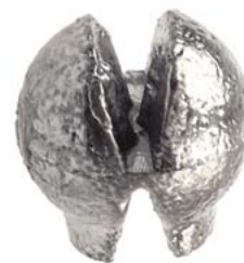
pinch the "ears" to remove