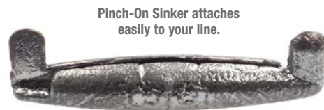
Pinch-On Sinker attaches easily to your line.

Pinch-On Sinkers are very easy to attach and remove from the line. The ears of the sinker are simply folded over the line, which gives the Pinch-On a streamlined shape when attached. It is important to use only soft lead when casting Pinch-On Sinkers to ensure that the ears will bend easily.