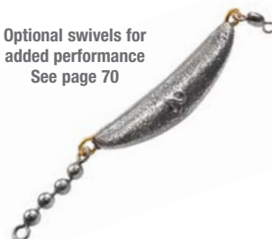
Optional swivels for added performance See page 70