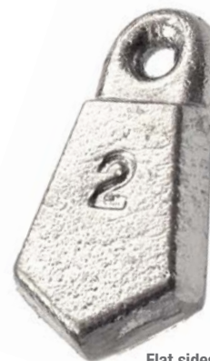
Flat sides resist rolling in moving waters