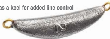
Brass wire eye prevents line abrasion See page 70