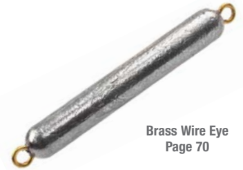
Brass Wire Eye Page 70

Write a few great "Fish Stories" with the versatile Pencil Sinker. Can be used as an in-line sinker with double brass wire eyes or as a bottom bumper-type sinker using only one eye.