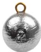
Round shape for a fast descent

Cannon Balls drop faster and straighter than other sinkers. Load your rig with these round sinkers and shoot your lure down to the depths you need.