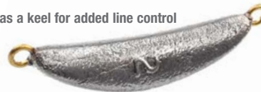
Brass wire eye prevents line abrasion See page 70