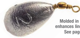
Molded in swivel enhances line control See page 70

Battle with the Bass, not your line! Bass Casting or Swivel Bell sinkers feature a molded-in swivel, so you don't become the frustrated "twisted" fisherman.