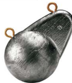
Special casting equipment. See page 96