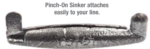
Pinch-On Sinker attaches easily to your line.

Pinch-On Sinkers are very easy to attach and remove from the line. The ears of the sinker are simply folded over the line, which gives the Pinch-On a streamlined shape when attached. It is important to use only soft lead when casting Pinch-On Sinkers to ensure that the ears will bend easily.