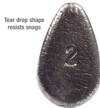
Tear drop shape resists snags

The flat, low profile does not drift with the current, so your line stays in place. A CP332 Core Pin for each cavity is included. Core pins can be stripped away immediately in the mold or later after the extracted parts have cooled. Extra CP332 parts are available to increase molding speed.