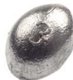
Fish won't detect the Egg Sinker until it's too late

“Slip” by your fish undetected. The line will slip through the Egg or Slip sinker, so the fish will not feel the weight of the sinker when it picks up the bait. The hook settles more quickly without the sinker’s resistance. Plus, the fish can’t use the sinker’s weight to help throw the hook when breaking water. This fish won’t be the one that “got away.”