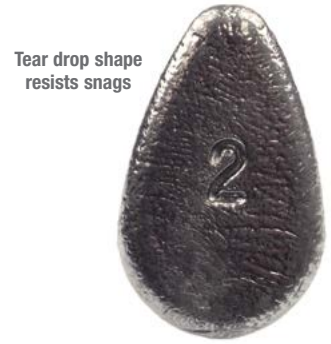
Tear drop shape resists snags

The flat, low profile does not drift with the current, so your line stays in place. A CP332 Core Pin for each cavity is included. Core pins can be stripped away immediately in the mold or later after the extracted parts have cooled. Extra CP332 parts are available to increase molding speed.