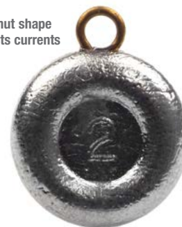
Donut shape resists currents