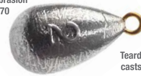
Teardrop shape casts smoothly