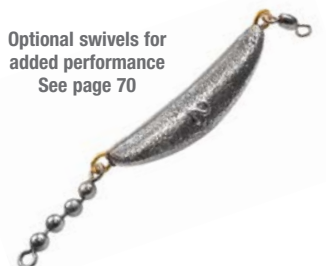
Optional swivels for added performance See page 70