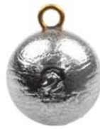
Round shape for a fast descent

Cannon Balls drop faster and straighter than other sinkers. Load your rig with these round sinkers and shoot your lure down to the depths you need.