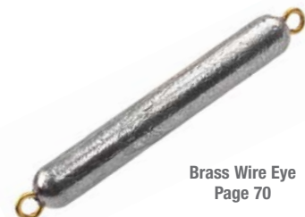
Brass Wire Eye Page 70

Write a few great "Fish Stories" with the versatile Pencil Sinker. Can be used as an in-line sinker with double brass wire eyes or as a bottom bumper-type sinker using only one eye.