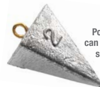
Pointed base can bury itself in soft terrain

The Pyramid Sinker excels in strong currents with any bottom condition. The pyramid tends to bury itself if the bottom is soft. On hard bottoms, the flat sides will prevent the pyramid from rolling with the current.