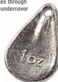
Glides through the undercover